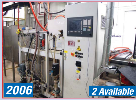
RAMPF DISPENSERS MODEL DS4