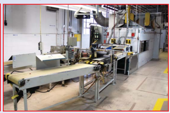
DUAL FEED CONVEYOR SYSTEM