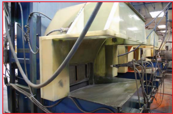
NORDSON FRONT VIEW OF BOOTHS & PAINT GUNS