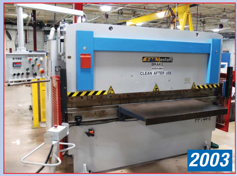
FABMASTER 8' X 44 TON HYD, PRESS BRAKE