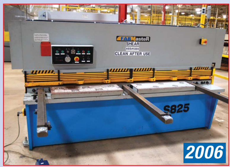
FABMASTER 8' X 1/4" HYD. SHEAR