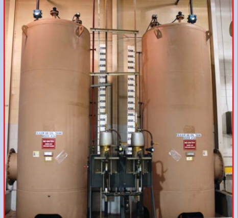
14 Robots Available!