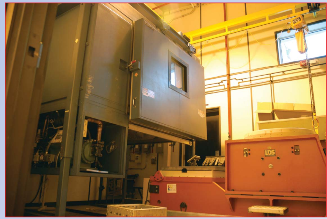
ESPEC AGREE CHAMBER MODEL ET114-10PA &

LDS: LING DYNAMIC SYSTEMS MODEL V864-640LT VIBRATOR PLUS LPT 750 SLIP TABLE COMBO