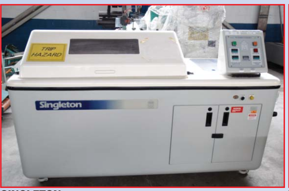
SINGLETON PSF22 MULTI FOG CORROSION TEST CHAMBER

LDS: LING DYNAMIC SYSTEMS MODEL V864-640LT VIBRATOR PLUS LPT 750 SLIP TABLE COMBO