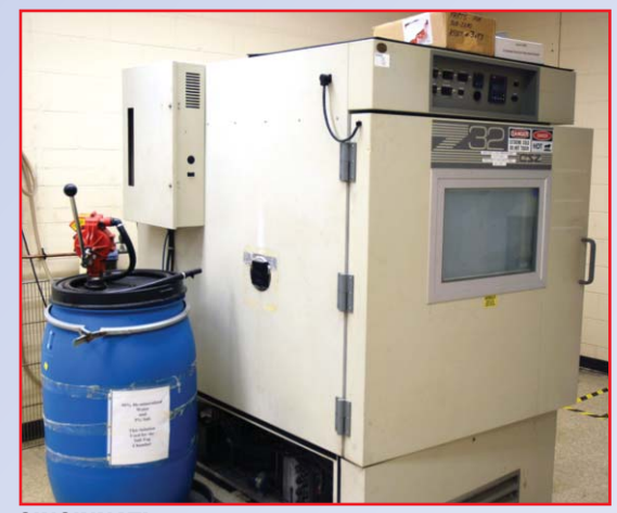
CINCINNATI TEST STAND MODEL ZH-32-2-2-H/AC

For Complete Equipment List and Photos, Visit InfinityAssets.com