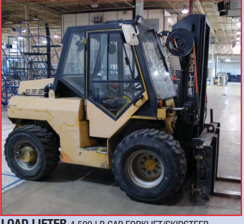
LOAD LIFTER 4,500 LB CAP FORKLIFT/SKIDSTEER