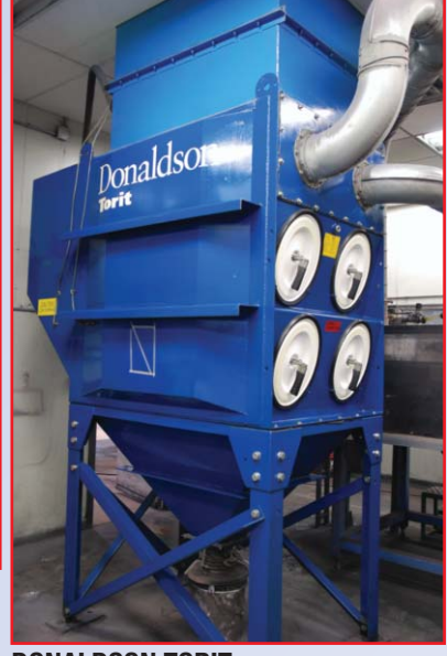
DONALDSON TORIT DUST COLLECTOR