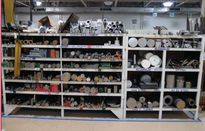
PARTIAL VIEW ASSORTED RAW MATERIAL