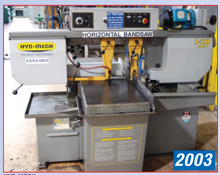
HYD MECH S-20, SERIES II HORIZ. BANDSAW