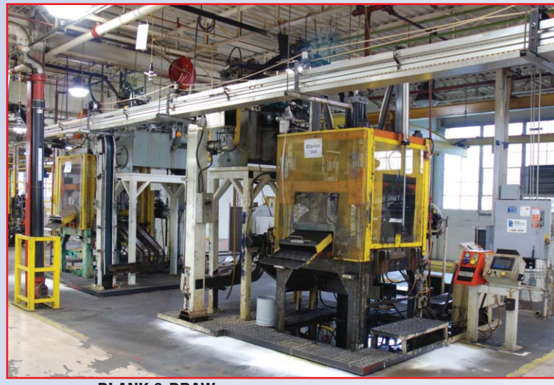
(2) 50 TON HYD. BLANK & DRAW PRESSES