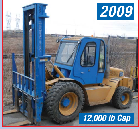
OMEGA LIFT SERIES 2X4