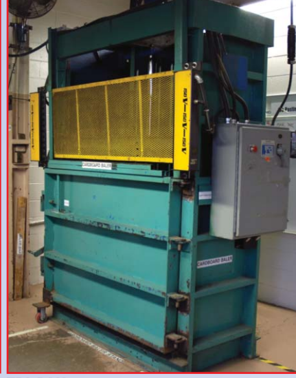
TRI-PAK CARDBOARD BALER