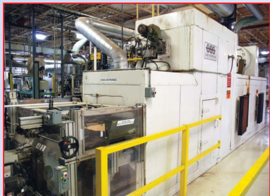
MOORE AIR END DISC CURE OVEN