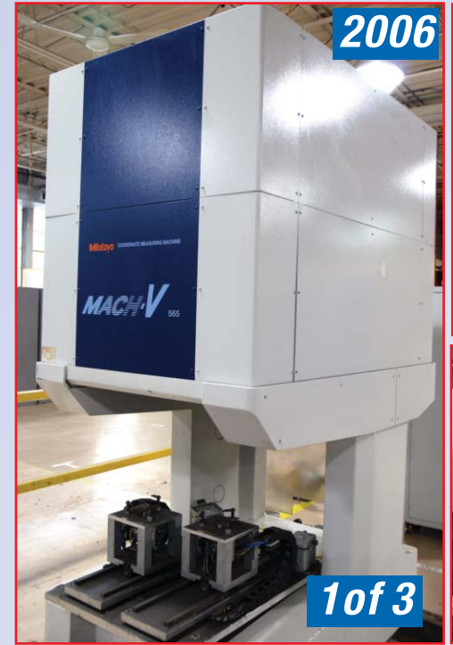
MITUTOYO IN LINE CMM MODEL MACH-V565