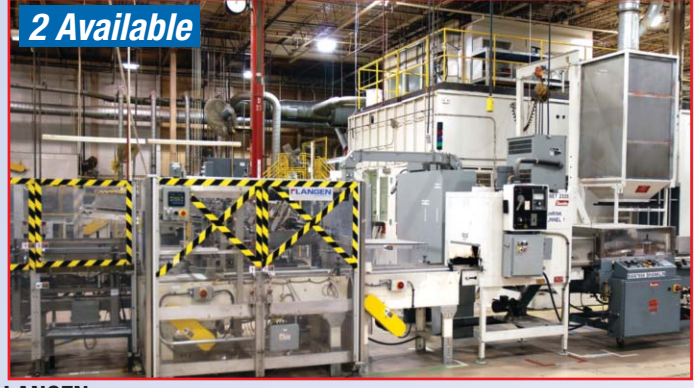
LANGEN UNIT BOXER