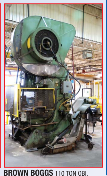
MODEL 20 LJ

TRAK CNC Lathe Model TRL 1840V. 18"x40", ProtoTrak VL Control, 2-1/4" Bore, 10" 3 Jaw Chuck, Tailstock, Steady Rest, Toolpost, 80-2,500 RPM 2 Speed Range Spindle Motor, 10 HP, sn 032BB12184