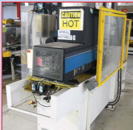
NORDSON SPIRAL HOTMELT