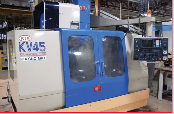
KIA CNC VMC MODEL KV45