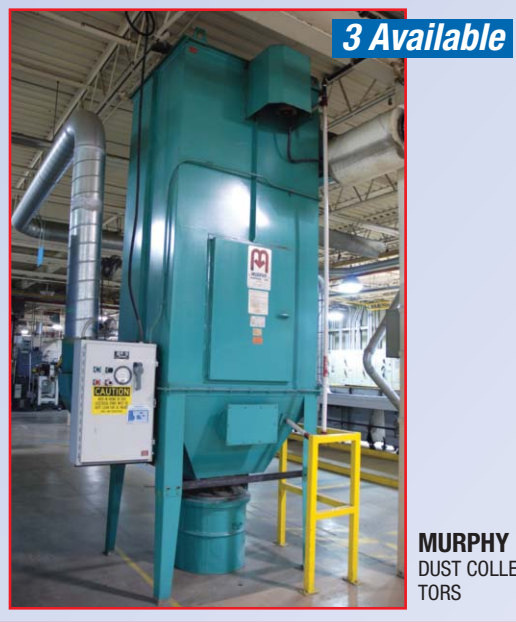
MURPHY DUST COLLEC- TORS