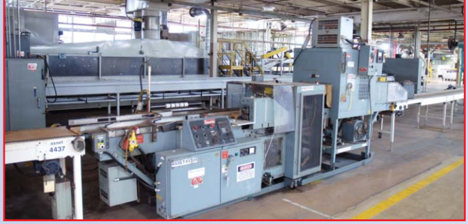
SHANKLIN SHRINK TUNNEL & HEAT SEALER