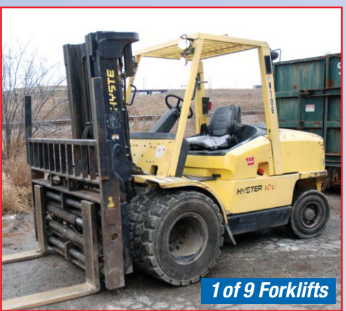
HYSTER H 100 XM 8.750 LB CAP