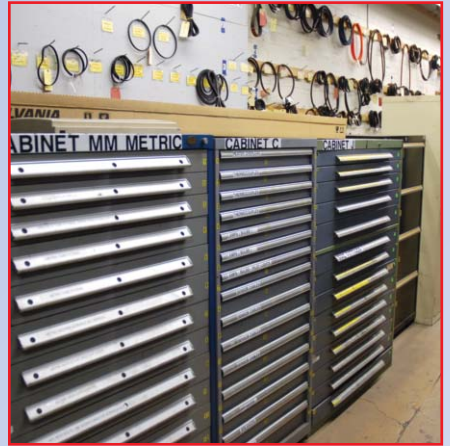
PARTIAL VIEW OF 1,000 SQ FT NEW & USED SUPPLIES & STORES DEPARTMENT