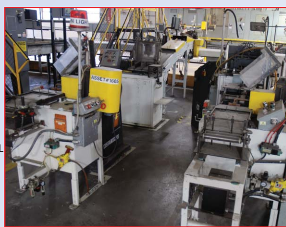
PLEATERS, AUTO SPLICERS, STRAIGHTENER, FEEDERS, CUTTERS, DEREELERS