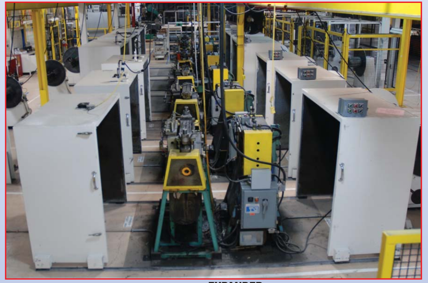
VIEW OF 6 METAL EXPANDER LINES