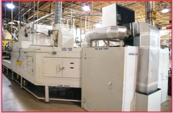
MOORE AIR CURE OVEN