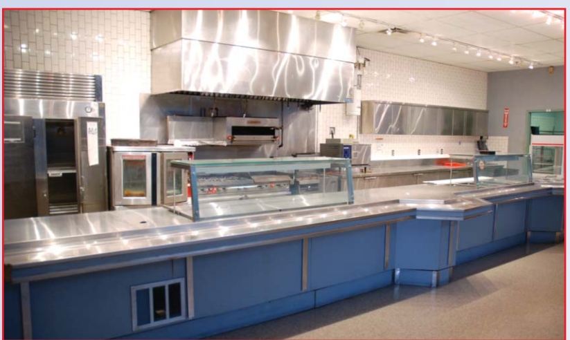
COMPLETE INDUSTRIAL KITCHEN & CAFETERIA – PARTIAL VIEW

TENNANT Model Typhoon 16B Vacuum EPPS Portable Power Steam Pressure Washer, Model 3500 P-48, 3000 PSI, 7.5 HP, 575V, sn 20071132