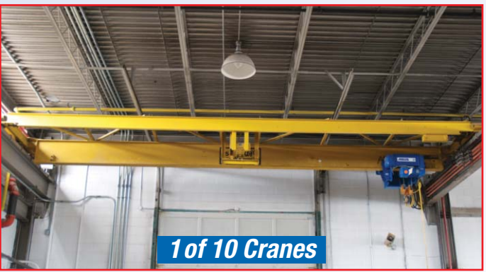
LOAD LIFTER 5 TON, 30' X 90' CRANE