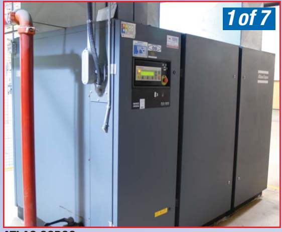
ATLAS COPCO 200 HP AIR COMPRESSOR