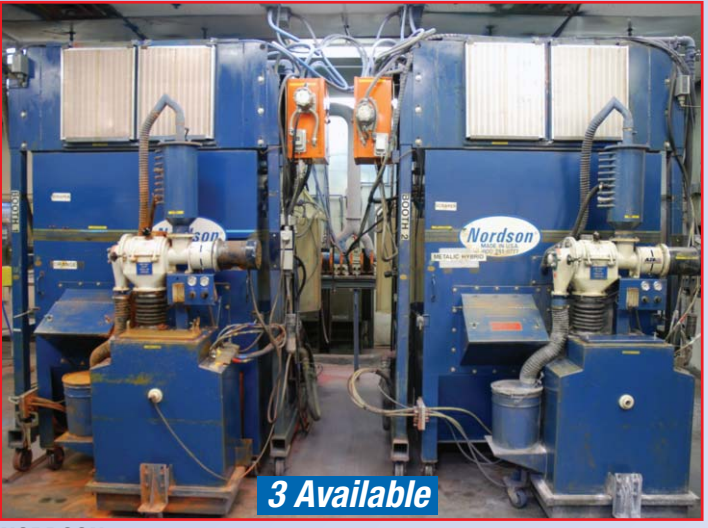
NORDSON AUTO PAINT BOOTHS, MODEL CP 25-55