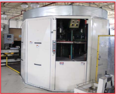
10 STATION HEATED CURE WHEEL