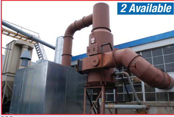
CGS AIR SCRUBBERS