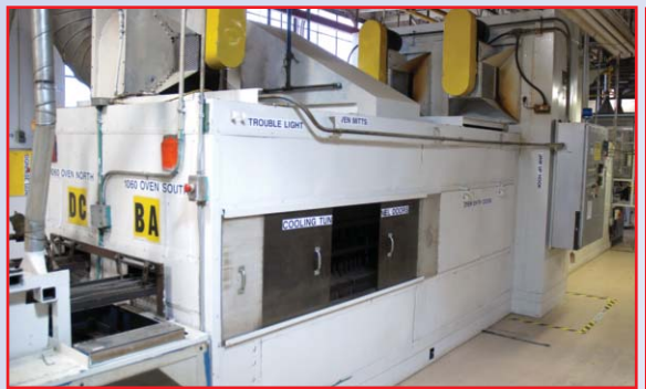
MOORE AIR PAPER CURE OVEN