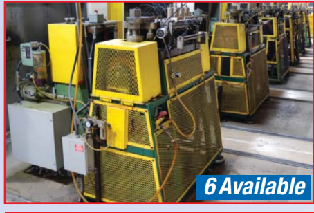
DUAL STA-TION EX- PANDER MACHINES 17" CAPAC-ITY, SOUND ENCLOSURES