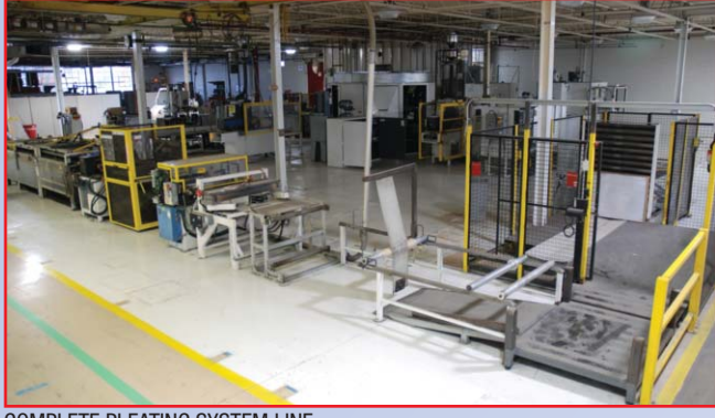
COMPLETE PLEATING SYSTEM LINE