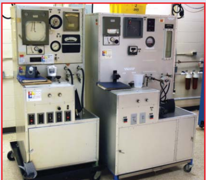
PENN ANDERSON CLASS A & B TEST STANDS