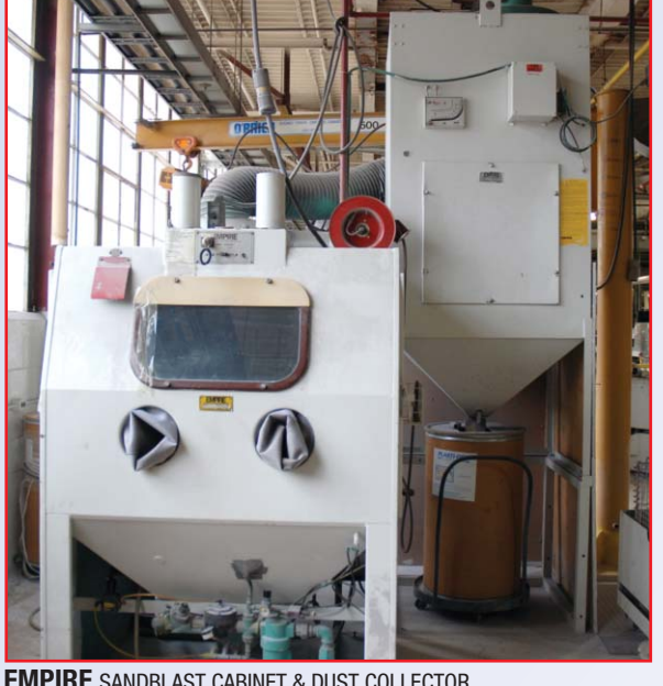
EMPIRE SANDBLAST CABINET & DUST COLLECTOR