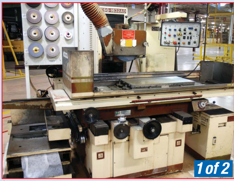
CHEVALIER 16" X 32" AUTO SURFACE GRINDER