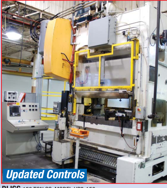
BLISS 150 TON SS. MODEL HP2-150