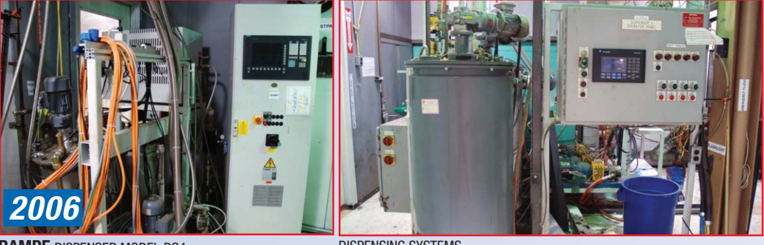
RAMPF DISPENSER MODEL DS4