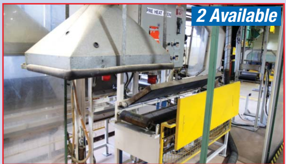
PRE HEAT OVENS 12"X60'