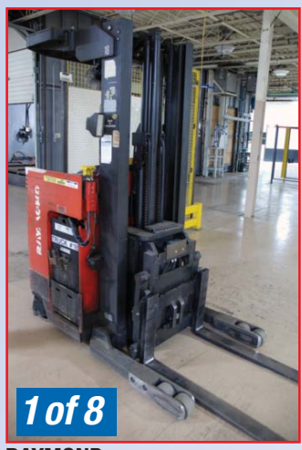
RAYMOND REACH TRUCKS,