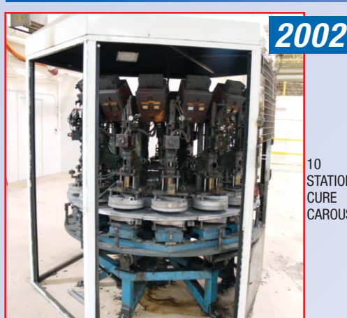
STATION CURE CAROUSEL