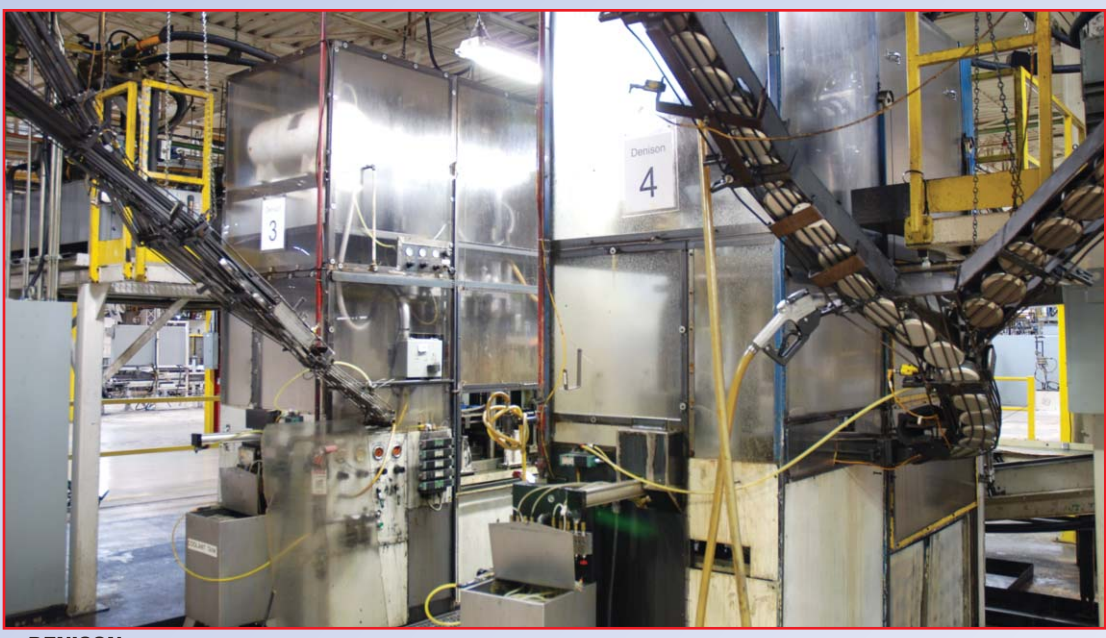
(6) DENISON 3 STAGE HYD. FILTER PRESSES