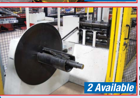
WALLNER UNCOILERS, SLITTERS,