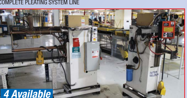
TAYLOR WINFIELD & BANNER 30 KVA SPOT WELDERS