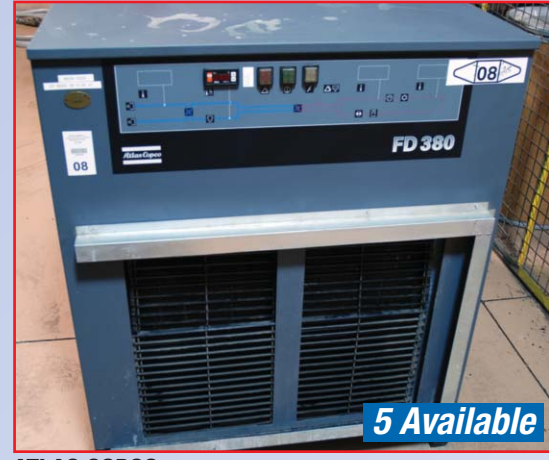
ATLAS COPCO FD380 AIR DRYER