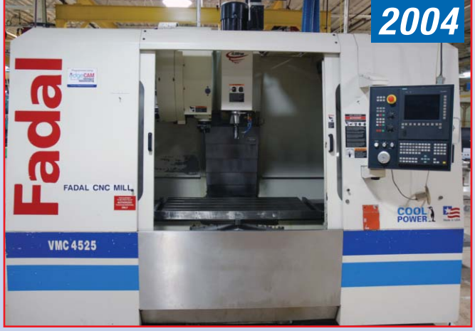
FADAL CNC VMC MODEL 4525HT

Plus: 15 Various Filter Lines, Complete CNC Machine Shop & Fabricating Department