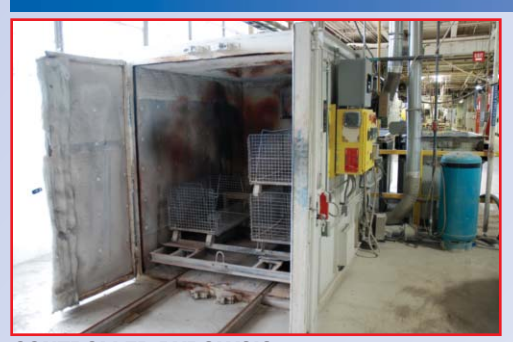
CONTROLLED PYROLYSIS FURNACE