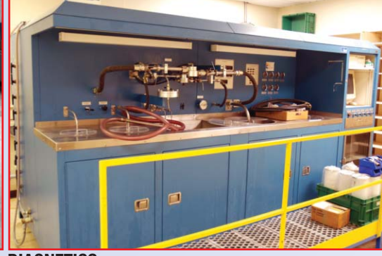
DIAGNETICS OIL FILTER MULTI PASS TEST STAND MODEL 4572