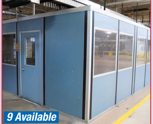
MODULAR OFFICES - UP TO 30'X50'