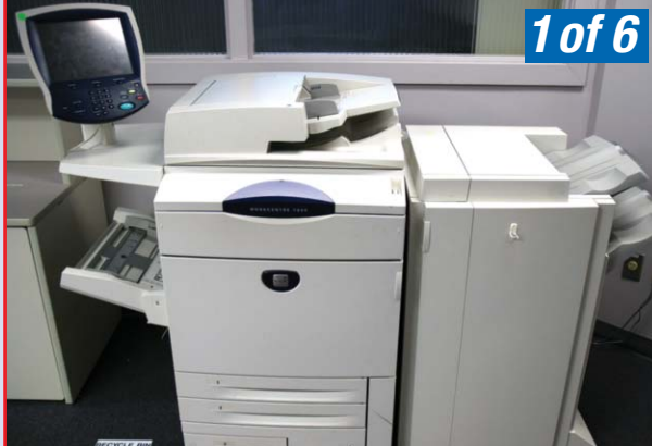
XEROX HIGH CAPACITY PHOTOCOPIERS