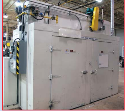
MOORE AIR PREHEAT OVEN