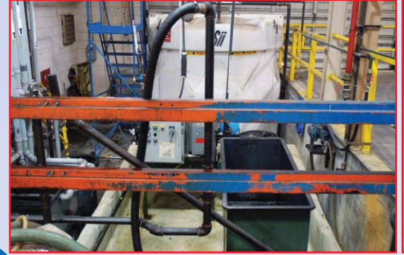
COMPLETE LIQUID WASTE RECLAIM SYSTEM